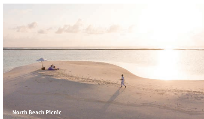
North Beach Picnic

In-Villa Dining options are available from 07:00 until 23:00, daily Bespoke Private Dining experiences around the lagoon Castaway picnics on deserted beaches Cooking classes