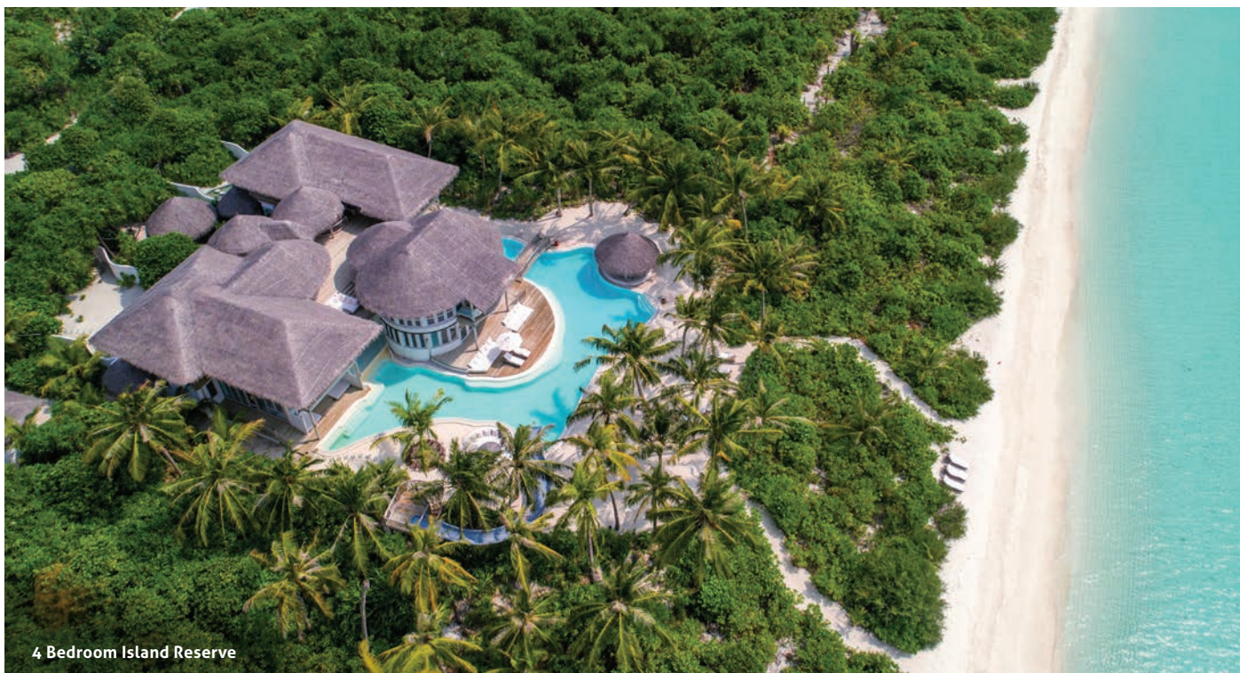
4 Bedroom Island Reserve